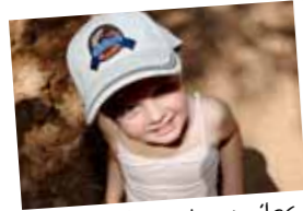
Spreading the smiles

Be part of this once in a lifetime experience, from Port Hedland to Broome, Derby, El Questro and mystery locations in between, finishing in Kununurra, 5-13 August 2011.